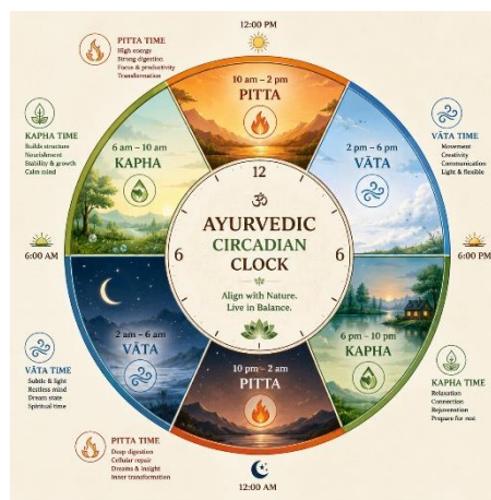
Figure 1: Daily Doṣa Dominance periods [20]

These fluctuations influence digestion, metabolism, cognition, circulation, elimination and mental activity. [6]